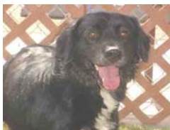
Name: "Chewbacca" ID#: A0728754 Sex: Neutered Age: 5 years Breed: Cocker Spaniel Mix