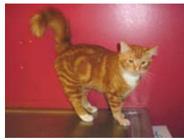
Name: "Lil' Floyd" ID#: A0727342 Sex: Neutered Age: 1 year Breed: Orange Tabby