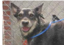
Name: "Rex" ID#: A0627215 Sex: Neutered Age: 2 years Breed: Airedale Terrier