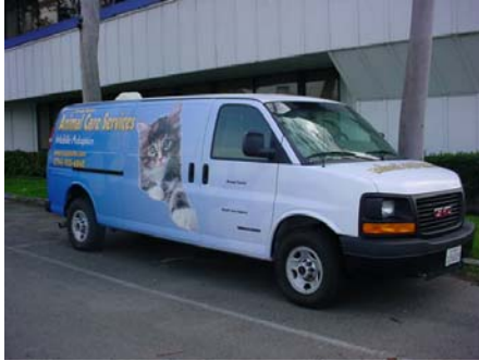
The Mobile Adoption van makes transporting animals easy and efficient.

Animal Care Services is always looking for ways to promote adoptable animals and bring them into the public eye. One way that we do this is through our participation in local community events. Each week we prepare animals at our shelter to go out into the public, and potentially find a new home. Mobile adoptions are a great way to promote animals, provide information to the public, and inform our local communities of the services we provide. Here is a list of the upcoming mobile events that ACS will be participating in: