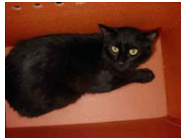
Name: "Devo" ID#: A0723824 Sex: Male Age: 1 year Breed: Domestic Med. Hair